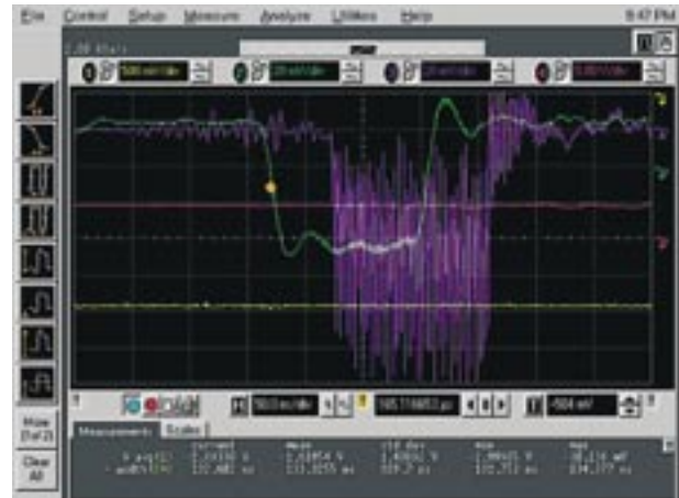
Beam diagnostics screen from September 15, 2002: 12 mA average circulating beam current at 2.9 GeV (yellow trace), 28 mA beam pulse passing FCT in booster ring (green trace), and 28 mA extracted beam pulse passing FCT beam transport line (purple trace) showing an extraction efficiency close to 100%.

The cover photo shows the extraction region of the booster ring. Photo courtesy of Canadian Light Source and University of Saskatchewan.